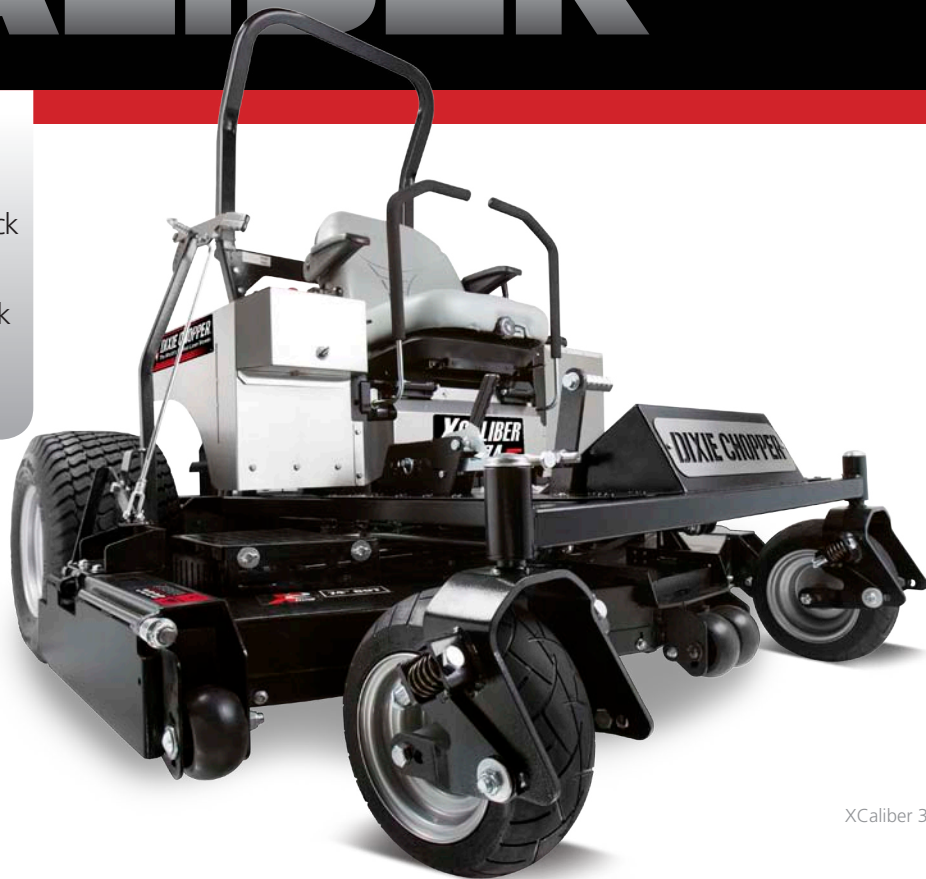
XCaliber 3574 shown*