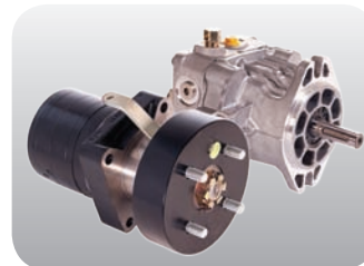
Pumps & Wheel Motors – Stronger transmissions for extended system life.