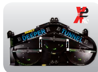
X2 "Wind Tunnel" Deck – Increases airflow and reduces build-up inside deck