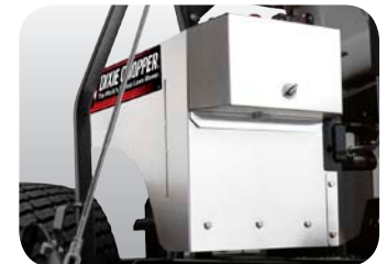
2x 7 Gallon Fuel Tanks – Eliminate frequent fill-ups with more fuel capacity.