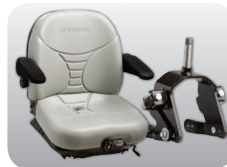
Total Comfort – Suspension seat and springer forks for best quality ride.