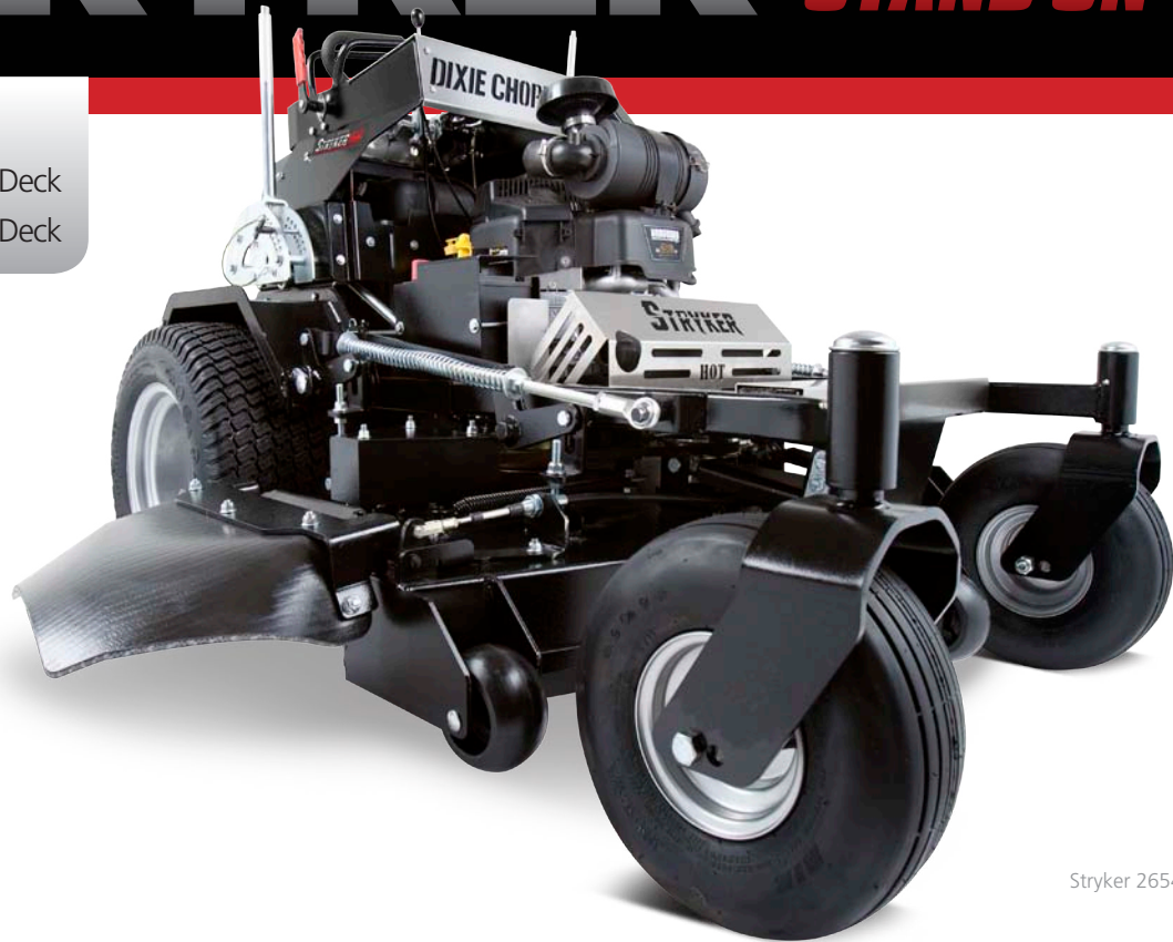
Stryker 2654 shown*