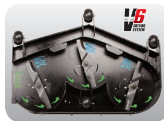
48"/54" V6 Cutting System – Deeper deck for cutting through thick grass.