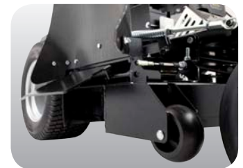
OCDC – Open and close the discharge chute on command.