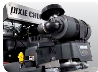
Vanguard® Engine – 26 horsepower commercial engine.