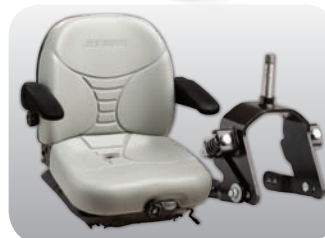
High Performance Package – Comes standard on KW and EFI models.