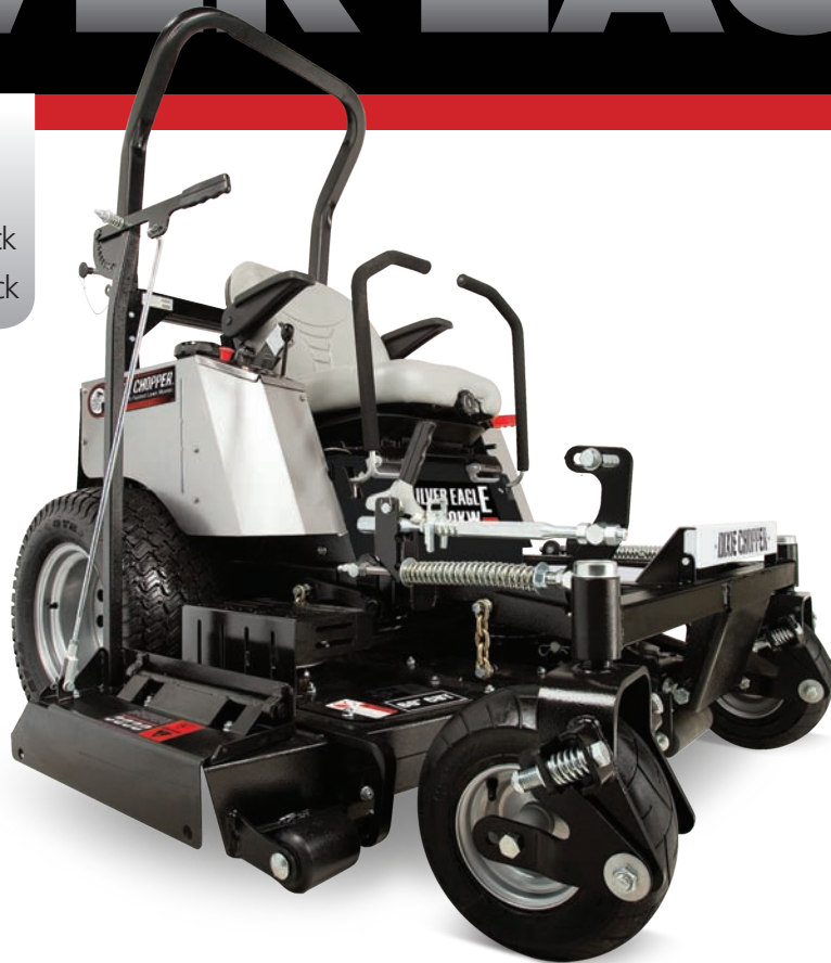
Silver Eagle 2760KW shown*