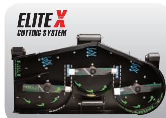
50" and 60" Elite X Deck – Cuts all grass types cleanly in any situation.