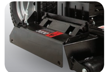
OCDC – Open and close the discharge chute on command.