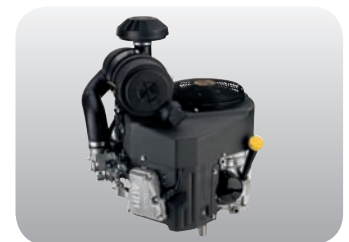
Kawasaki® FX – High on power, low on emissions.