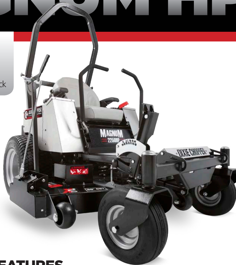
Magnum 2250HP shown*