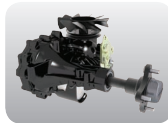
Hydro-Gear® ZT-3400 – Commercial-grade transaxle with serviceable filter.