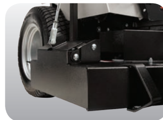
OCDC – Open and close the discharge chute on command.